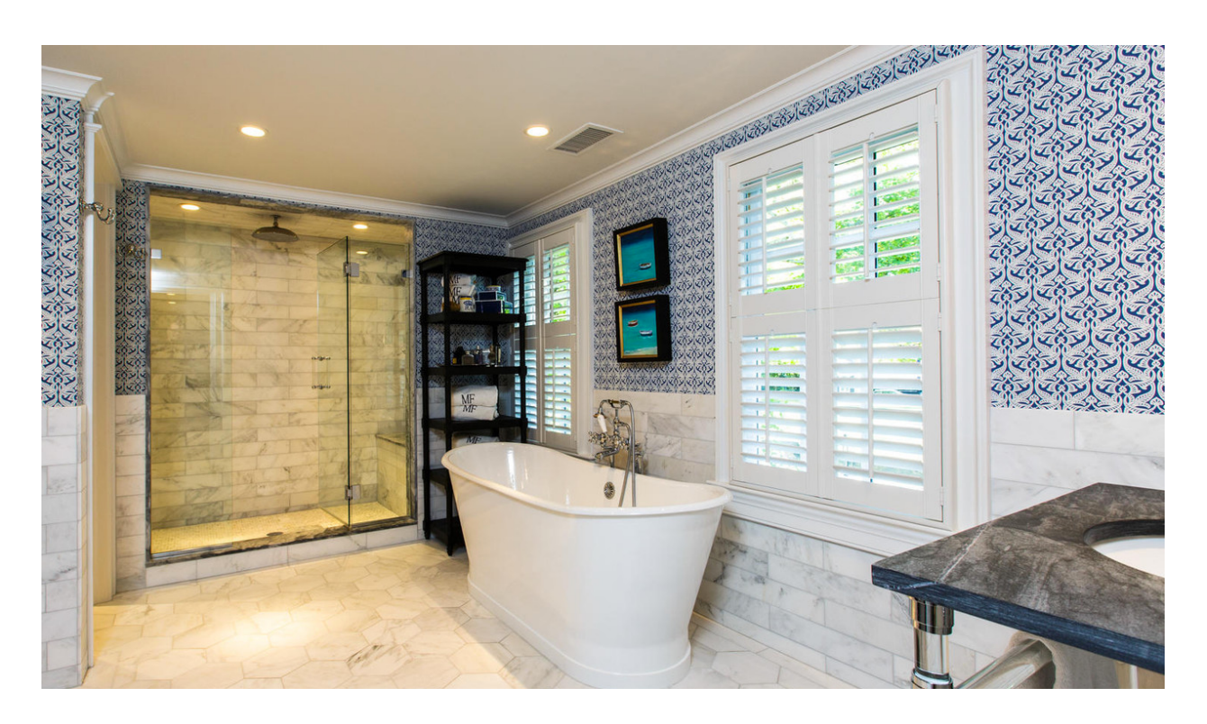
The master bath was once a small bedroom and bath.