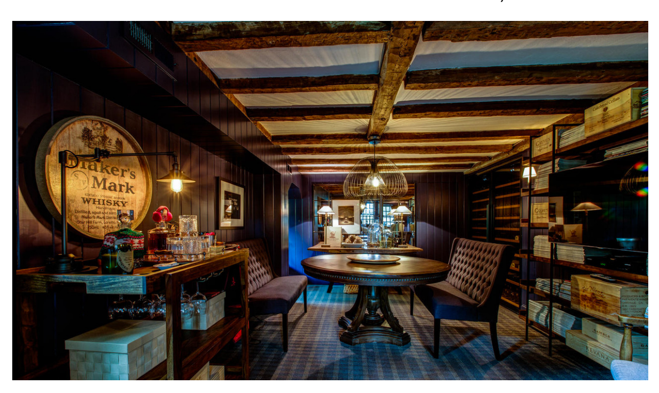
The wine room has refrigerated storage for 700 bottles. The panelling is painted navy. 'It's our getaway room,' says Mr. Canoro.