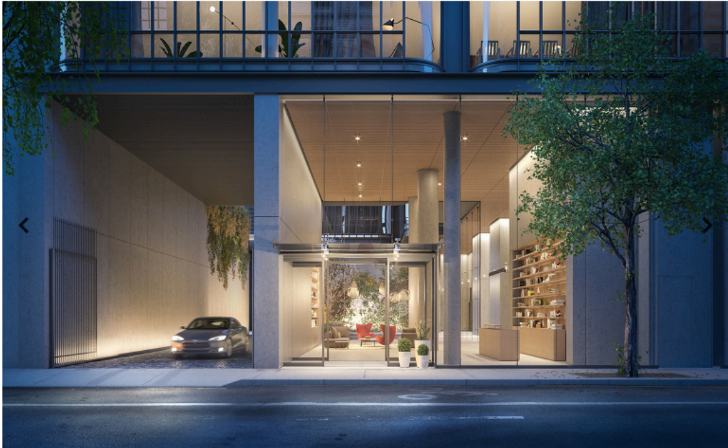
565 Broome Street features a gated circular driveway complete with an automated parking system. The double-height lobby is manned by a 24-hour concierge