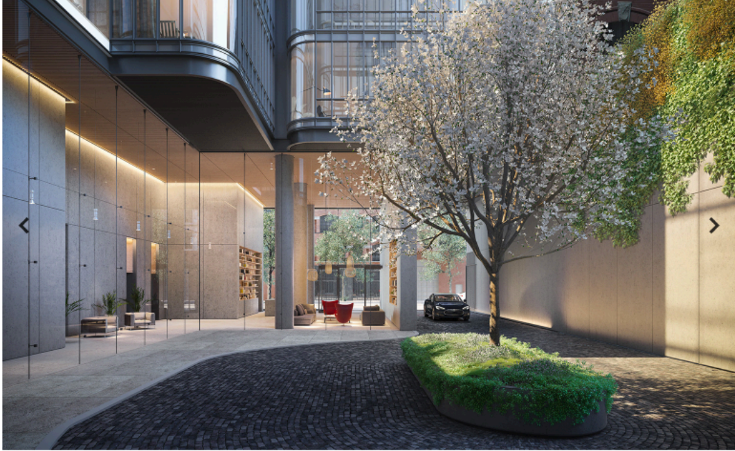
Located in New York's SoHo, Renzo Piano's 565 Broome Street is set to be a peaceful retreat from the lively neighbourhood's bustle