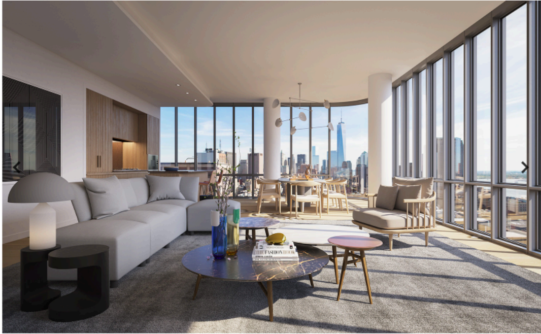
The unit interiors have been designed by Paris-based design practice RDAI